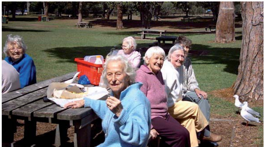
We have had several trips along the coast, enjoying fish and chips and the perfect sunny days.

Residents have been busy with Easter crafts and a raffle was held to help celebrate this time.