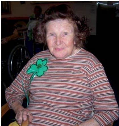
St Patrick's Day

In the past two months some of the special events we have celebrated were St Patrick's Day, Bluey Day and Easter.